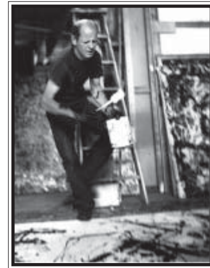
Jackson Pollock 1912-1956